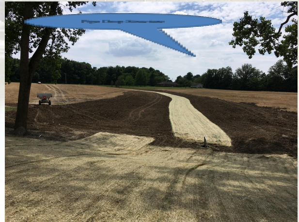
(Charles Sheldon Pipe Drop Structure)