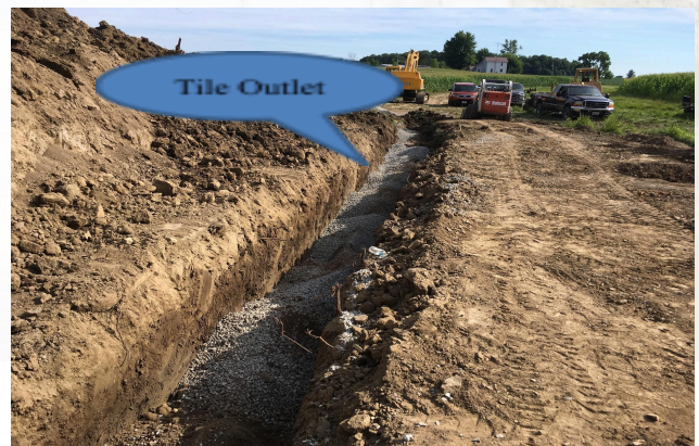
(Dusty Wilcox Tile outlet repair)