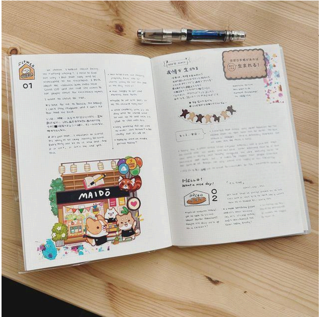
Credit to Ameruu : Permission was granted to repost her journal images here

Filled with the written musings of Tempuras and small, cute doodles, we hope to capture the Tempuras' thoughts of the boys' various streams across the year as a review of their activities, and to let them know how we've followed their journey all this time!