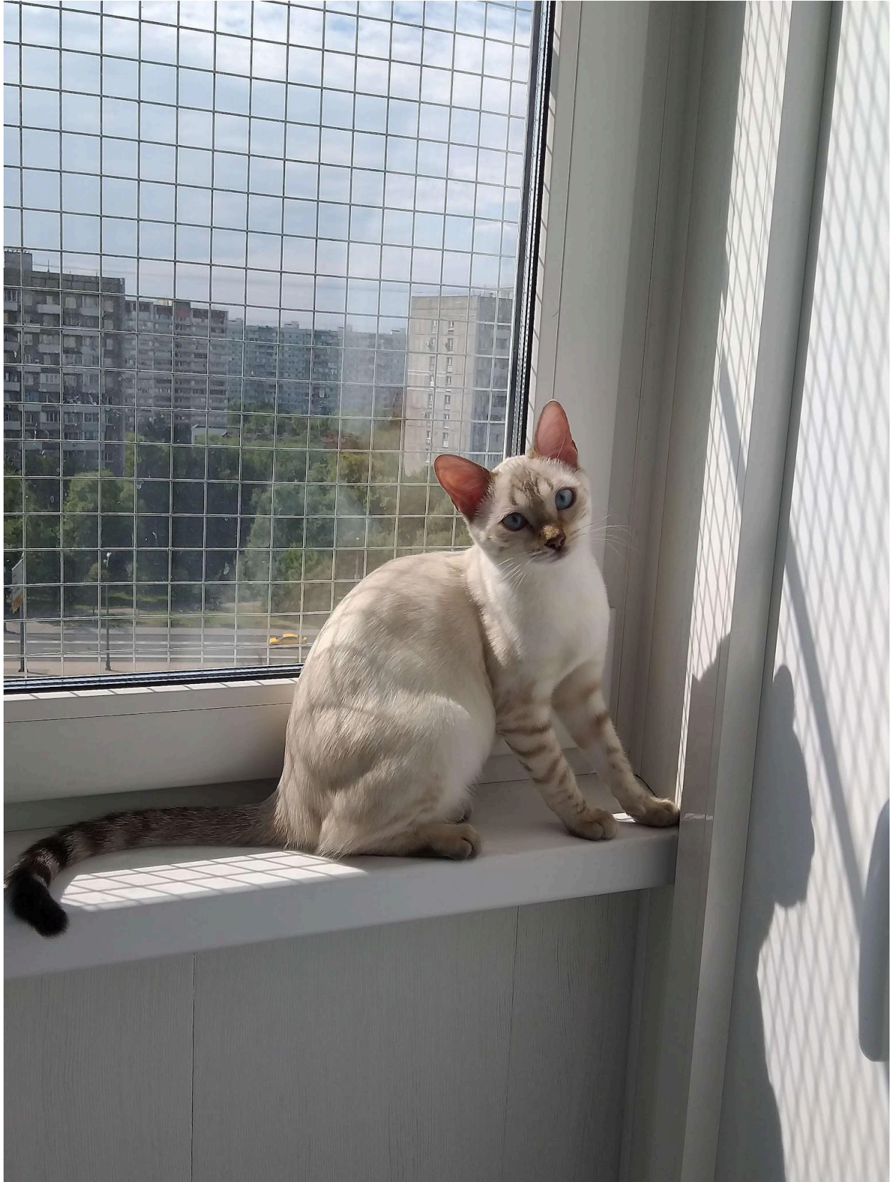
She was diagnosed with FIP. The treatment that she gets seems to work (thanks God). And it