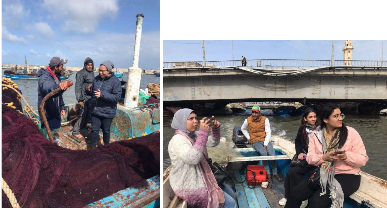
Figure 1 Fieldwork of surveying and monitoring.

The Fieldwork was implemented by monitoring and surveying; monitoring in general the intangible cultural heritage geographically in the areas of El-Manshia, Moharam Bek, Bahry, and El-Max, helps in setting a time plan for documenting the elements, as some of them are practiced on a seasonal basis and others daily, then the surveying which adopted a qualitative approach in which open-ended interviews were conducted. Interviews were conducted with different craftsmen and individuals concerned with intangible cultural heritage of Alexandria (El Desouky et al., 2022).