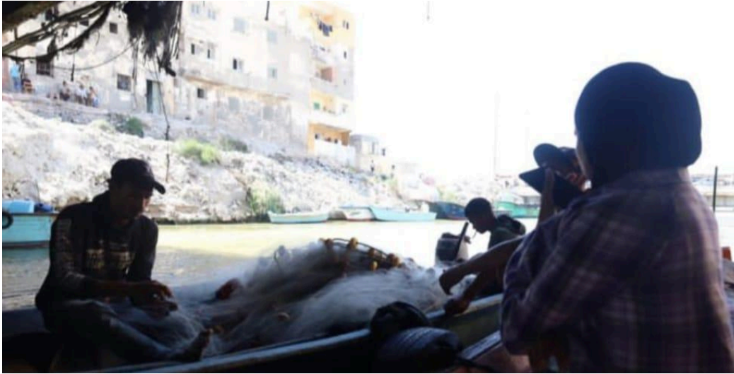
Figure 2 recording the interviews.