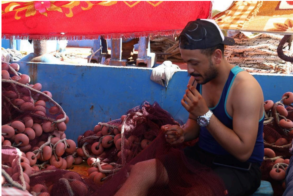
Figure 4 net repairing.