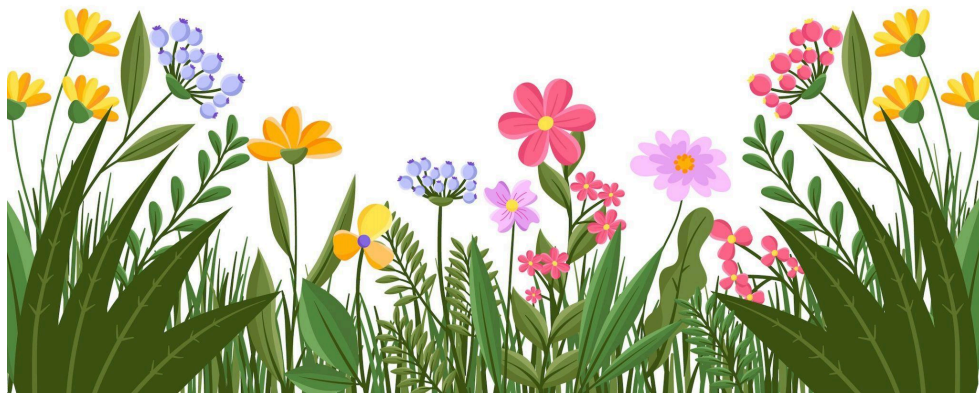
(Illustration of flowers of varying colours amid grass.)

We had a good walking tour. We were fortunate that it rained before and after the walking tour but not during. Throughout our walk, we noted accessibility facilitators and barriers. We explained what improvements we suggested and who the changes would benefit. We were impressed with the thought that had already been given to accessibility.