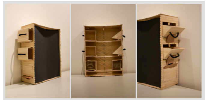
Figure 6 - Prototype 2

To better assess the four different drawer designs we had previously sketched out in our first iteration, we made a medium-resolution wood prototype. We tested three types of drawers: a hinged drawer, an open face drawer, and a spring-loaded drawer. We again used a Pugh matrix to decide on what drawer configuration we wanted to use for our product, as shown below.