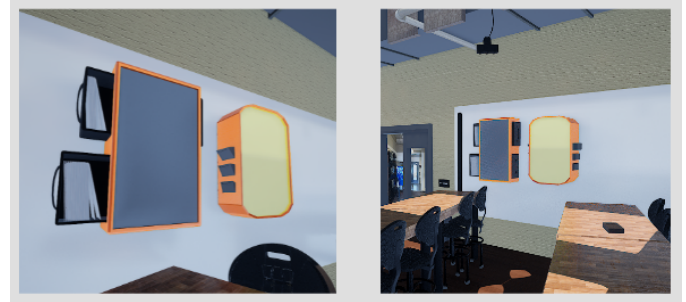
Figure 5 - Models of Prototypes

more rounded frame due to its better visual appeal, friendlier appearance, and easier use.