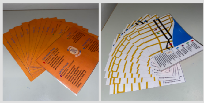
Figure 10 - Beauty Shots of Information Cards