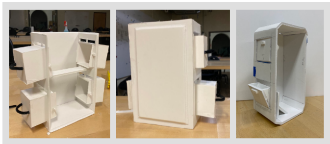
Figure 4 - Prototype 1A, 1B, and 1C

Having made this evaluation, we moved into the prototyping phase to visualize the potential shapes for the frame of the storyboard as well as to consider what different drawer configurations could look like.