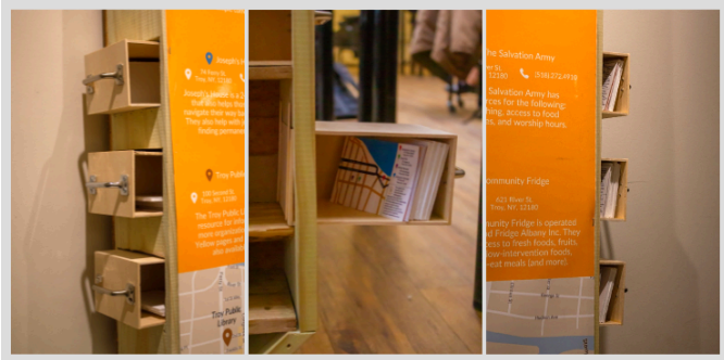
Figure 9 - Beauty Shots of Storyboard Prototype

Having made our decisions on specifics of the design in our second iteration, we moved forward to making a high resolution, full scale, and fully functional prototype of the storyboard. we also created high resolution models of the cards, as well as the front poster, as to give a fully-working and complete model of the storyboard.