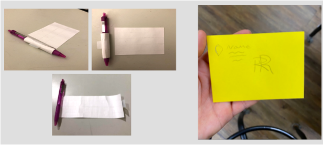
Figure 8 - Information Dissemination Modes