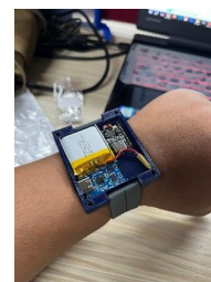
Fig. 2 Example of a low resolution image