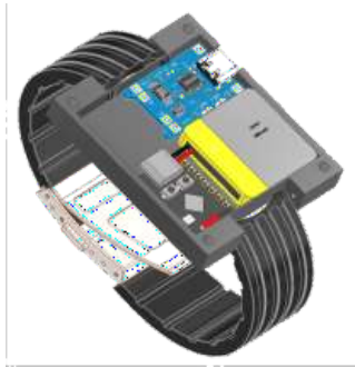
Fig. 3 Sample images with sufficient resolution

For images must use high resolution or at least it can be seen well, for example, Fig. 3, while wrong models or blurry images like in Fig.2 should not be applied to the DANI journal.