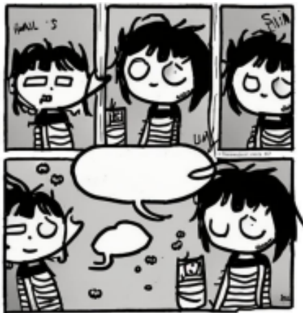
An A.I. generated image that I created when I used my name as a prompt

A.I. text-to-image generators such as Stable Diffusion, Midjourney and DALL-E exploded onto the scene this year and in mere months have become widely used to create all sorts of images, ranging from digital art pieces to character designs. Stable Diffusion alone has more than 10 million daily users. These A.I. products are built on collections of images known as “data sets,” from which a detailed map of the data set's contents, the “model,” is formed by finding the connections among images and between images and words. Images and text are linked in the data set, so the model learns how to associate words with images. It can then make a new image based on the words you type in.