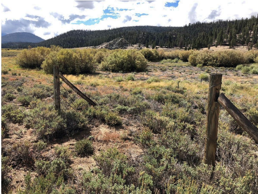
Wooden Fence Braces around Ramshaw Meadow