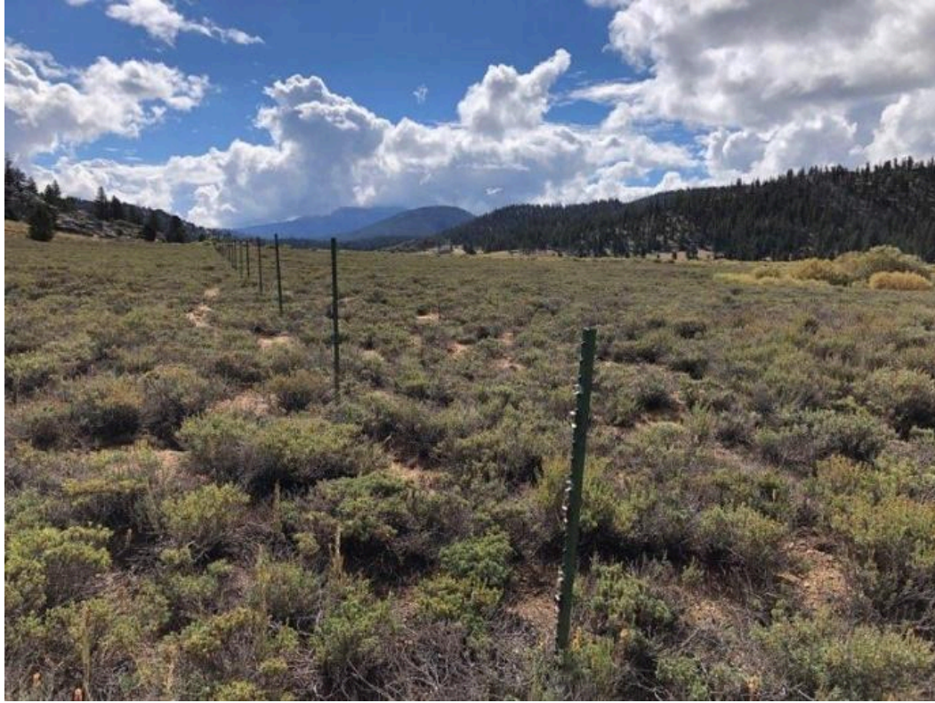
Barbed wire fence in Ramshaw Meadow