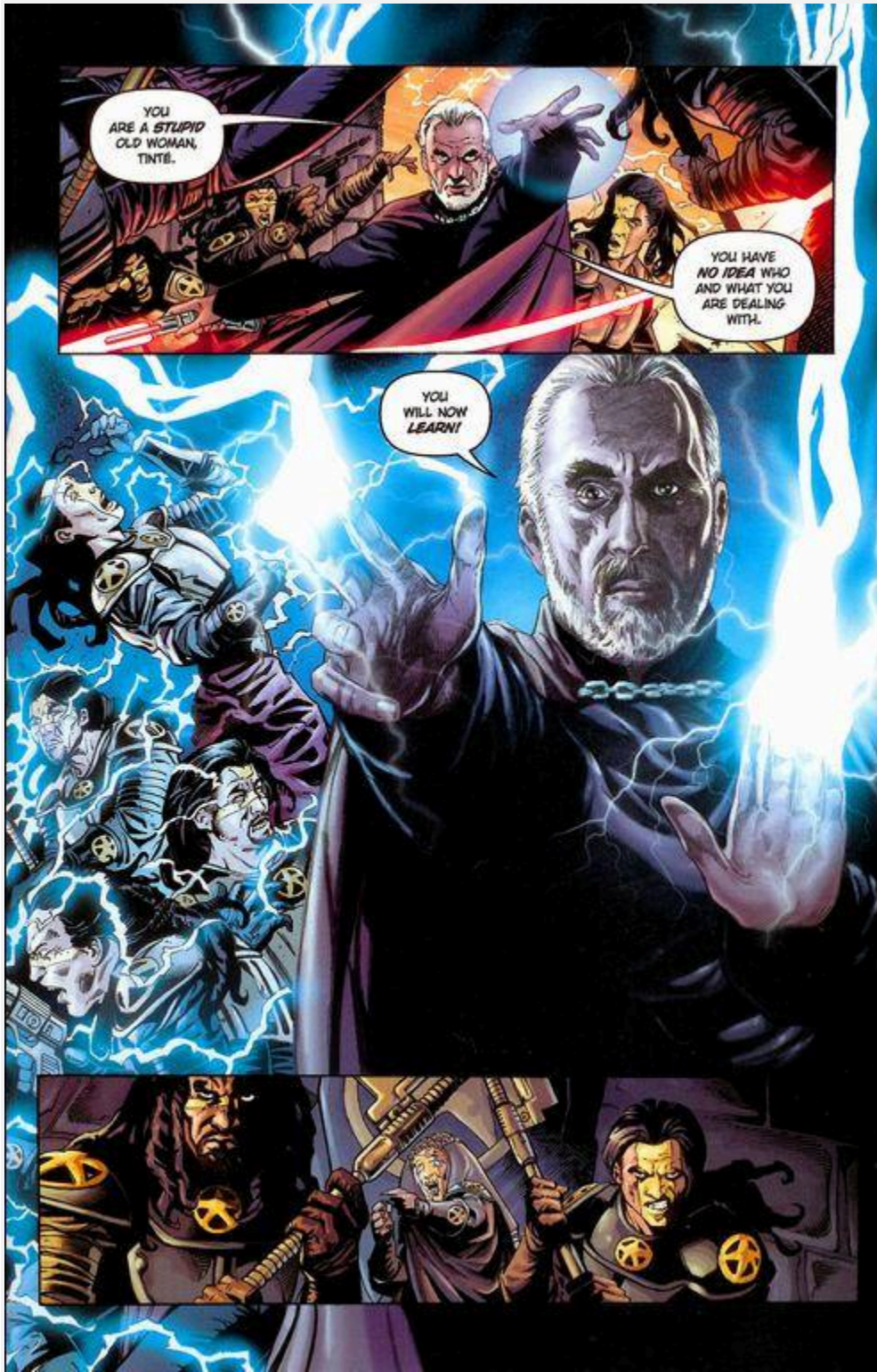
Lightning (this is obvious)