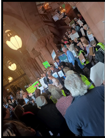
The Million Dollar Staircase