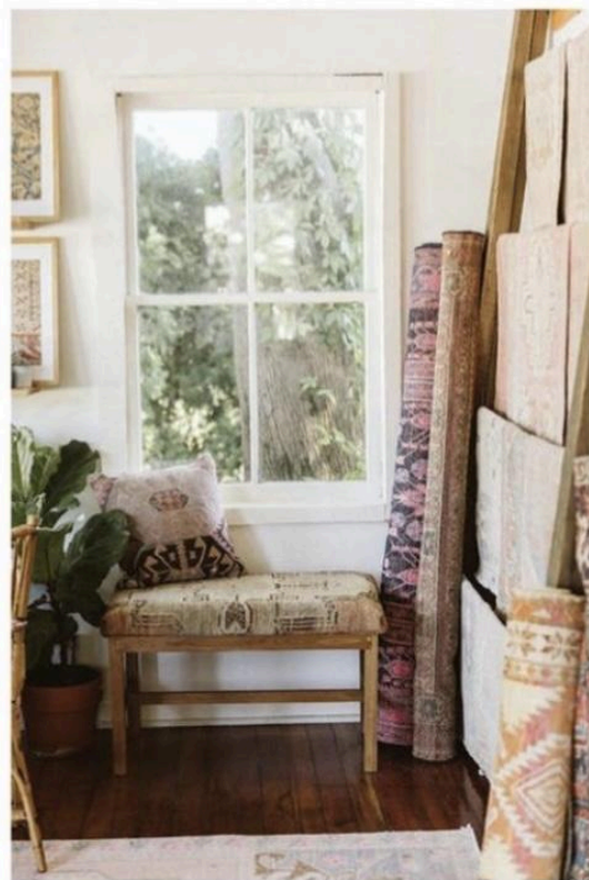
The rugs are made with natural dyes.

Once the rugs land in Wenham and Josh logs them in, Lindsey photographs and takes video from multiple angles, then promotes the beauties on Instagram with pertinent details, such as size, age, and origin. Every Sunday at 8 p.m., the new batch is available