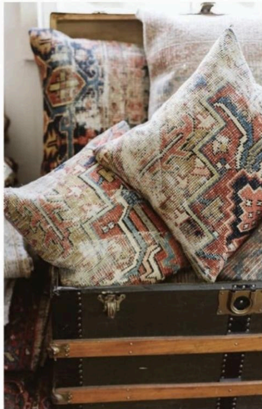
The shop also has other home goods such as pillows crafted from vintage rug fragments.