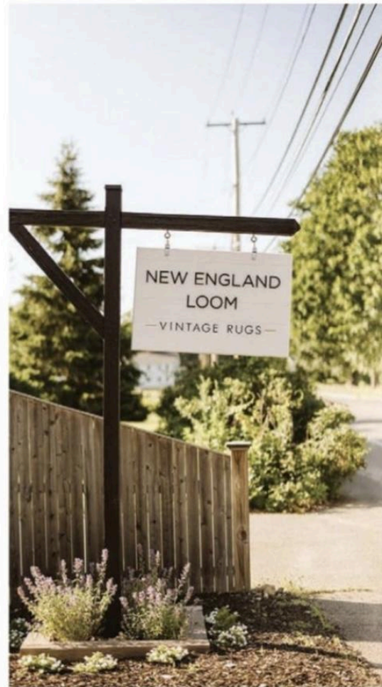
New England Loom is located in Wenham.