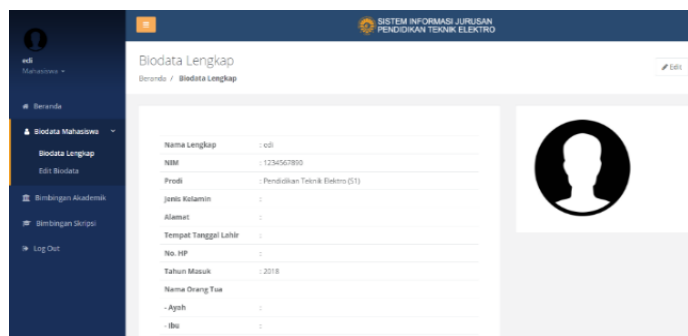
Figure 1. Student Page (Times New Roman, font 11)

All tables and figures that you insert in the document must be adjusted to the order of 1 column or the full size of one sheet of paper, to make it easier for the reviewer to observe the meaning of the figure.