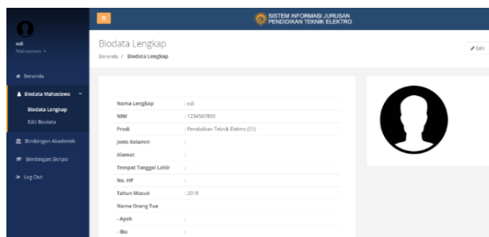
Figure 1. Student Page (Times New Roman, font 11)

All tables and figures that you insert in the document must be adjusted to the order of 1 column or the full size of one sheet of paper, to make it easier for the reviewer to observe the meaning of the figure.