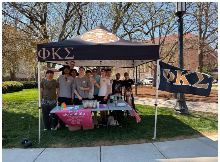
LLS Philanthropy in April!