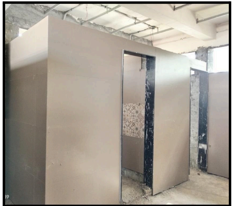
Improvement of COP & PF Surface at PF 1 & 2 (work in progress)