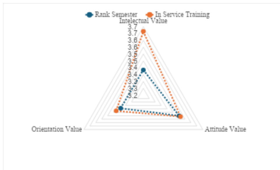
Figure 3. Title