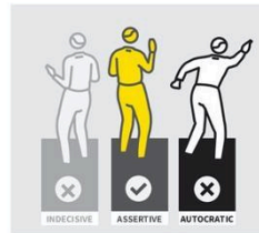
COMBINE ASSERTIVENESS WITH WARMTH