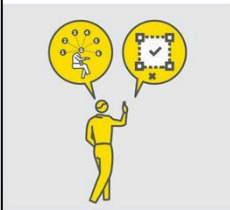
ESTABLISH NORMS AROUND CLEAR ROLES AND BOUNDARIES