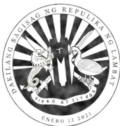
Kaprediem , on behalf of the Republic of Lambat