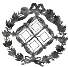
Soon_Forgotten , on behalf of Moloka