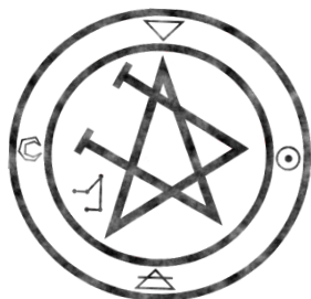
Smol_Bee , on behalf of the City of Letos