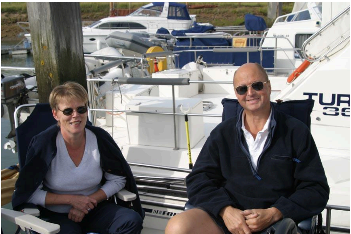
'Freya' - she was kept in Holland for several years