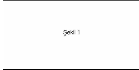
Figure 1. All figures must be in JPEG or TIFF format and must not be submitted as Excel extensions. Figure captions should be below the figure, in Palatino Linotype font, 10 point, aligned and specially hung (1.25 cm). The width of the figures should not exceed 6.3 cm for two columns and 13.2 cm for a single column. Each figure should be placed closest to the reference in the text. Before the Figure, a reference must be made to the relevant Figure.

The main purpose and objectives of the study, the most important results obtained in line with these objectives, and general evaluations and recommendations should be presented in this section.