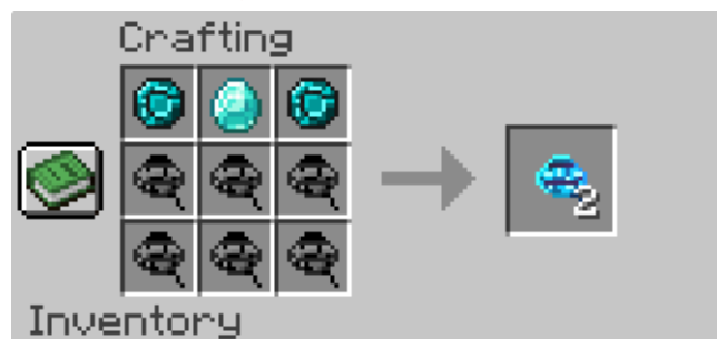
Mutated Steve Brain, 3x3 Grid.