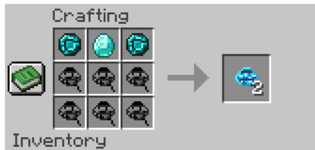
Mutated Steve Brain, 3x3 Grid.