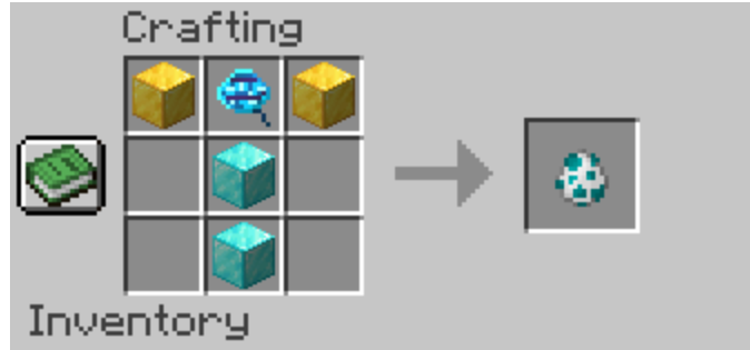
Herobrine Spawn Egg, 3x3 Grid.