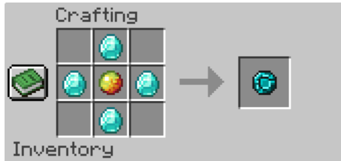
Mind Igniter, 3x3 Grid.