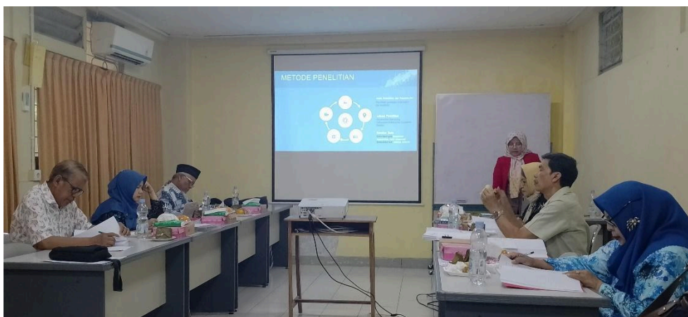
Figure 2. Title of the figure should be placed below the picture (10 pt)

If you are presenting your data in the form of bar graph, pie chart, frequency histogram, scatterplot, and other kinds of data-focused illustrations, the numbers and texts must be readable (in font size 10). Simple charts such as pie charts and bar charts should be editable (copied from Microsoft Excel; do not present them in the form of a screenshot) to allow for easy adjustments if need be. The figure should be bordered in a black line that spans the horizontal length of the paper. They must also be entirely original, unpublished artwork. Font type for the figure's text should be Calisto MT as well. Do not use wrap text for the figure!