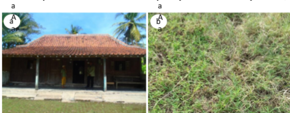
Figure 7. The appearance of Desa Bondowoso: (a) Majority of house type owned by the community; (b) Grass appearance of the community field.

Providing conformity to methods of community empowerment with problems, needs, and