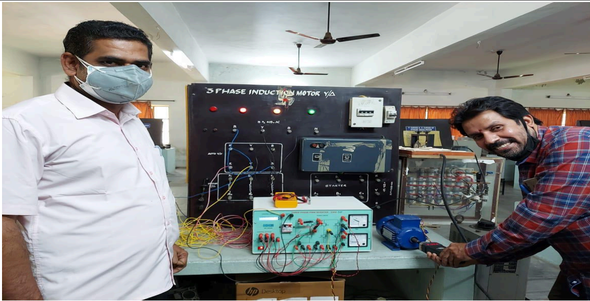
Three Phase PWM Inverter