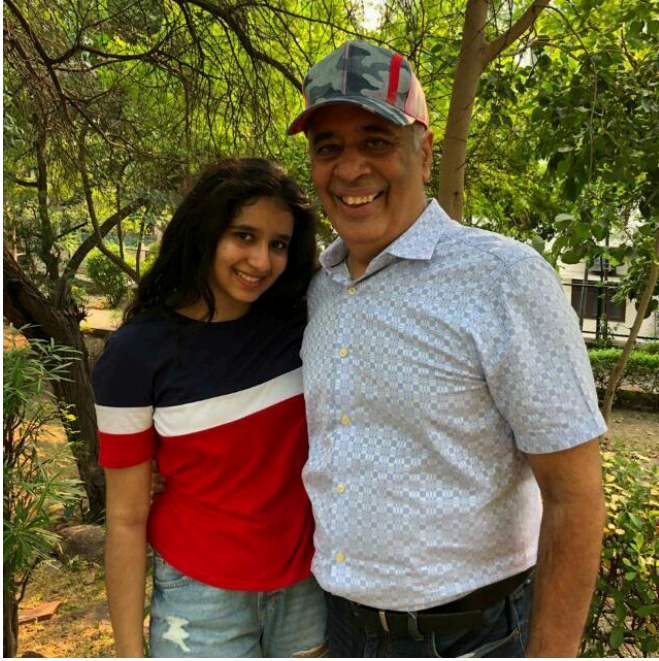
My daughter and myself in Delhi