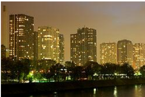
The Fifteenth Arrondissement-area in France Built with modern day buildings, which did not reflect the rest of Paris, having old and historical architecture.

"Rue Nelaton that the Velodrome D'Hiver stood. So basically, the past and Jewish history of the area has been erased and life goes on. If you look for it, you will see the memorial. Otherwise, it's like these horrific events never took place.