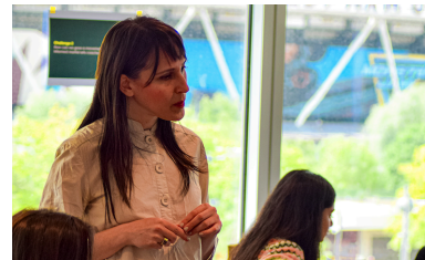
A hackathon about improving outcomes for violence survivors with trauma-informed self defence