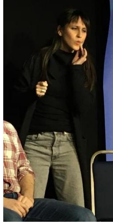
This is an improv scene about a toothache