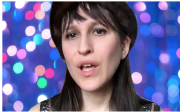
Lip syncing to Whitney Houston for a pandemic-era work zoom flash mob (sparkly shirt courtesy of downstairs neighbour)