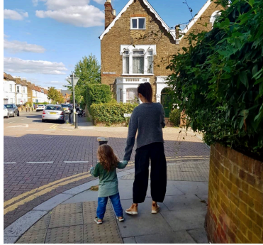
One of my favourite little friends and me