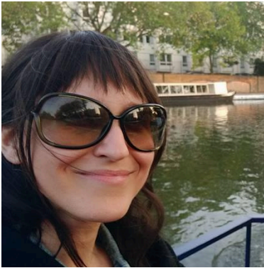
I lived on a boat for a while, and started to find land weirdly rigid