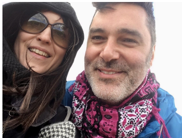
One of my besties and me on a cold UK beach walk