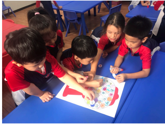
Students practice being Collaborators and Communicators in the Thai Class.