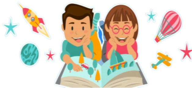
Figure 1. The Importance of Business Management