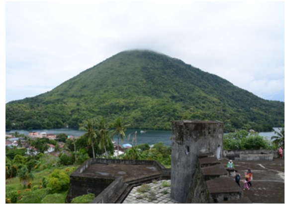
Figure 1. Banda Volcano

All images are displayed in color and numbered sequentially using Arabic numerals (1,2,3,4, and so on). Images are presented with good resolution. For photos, the minimum resolution is 600x800 pixels.