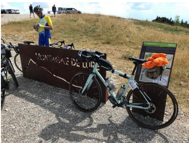
Another memory from a previous visit