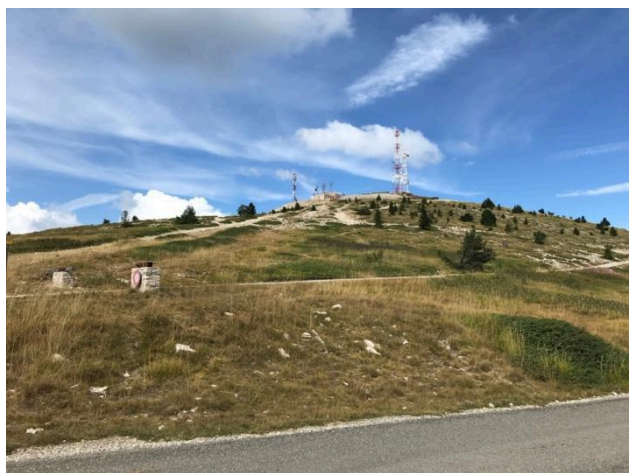
LURE observation station

A group of cyclos clutters the summit panel that we must display to attest to our passage. Then begins the first big descent to SISTERON.