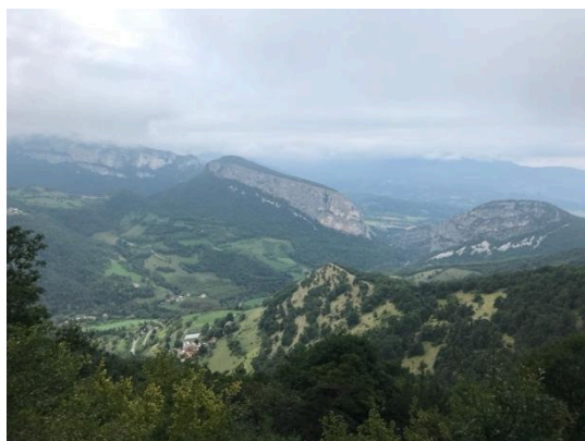
Before diving into SAINT JEAN EN ROYANS

The CARRI pass is an opportunity to meet two hikers and their pack donkeys.