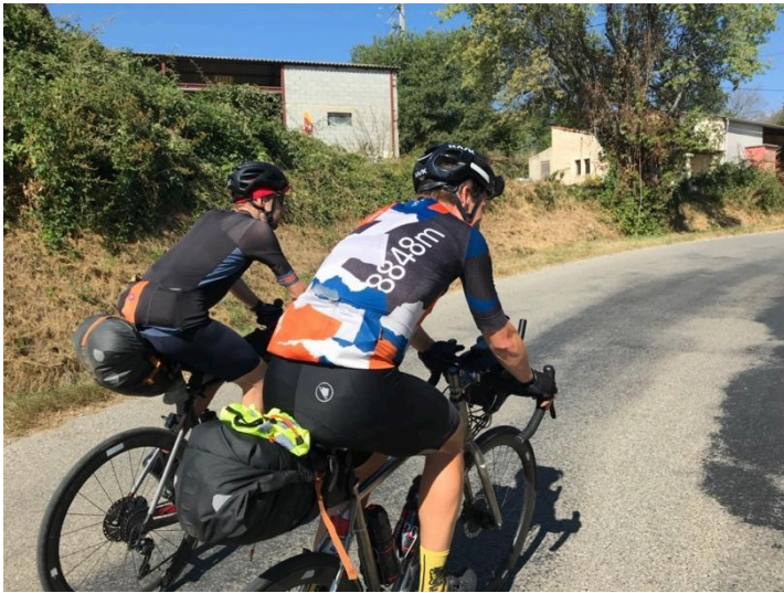
Another German pair after FORCALQUIER