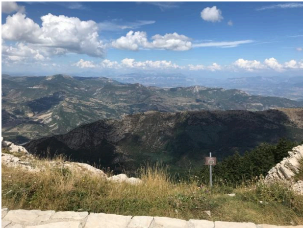
Superb viewpoint before the LURE signal