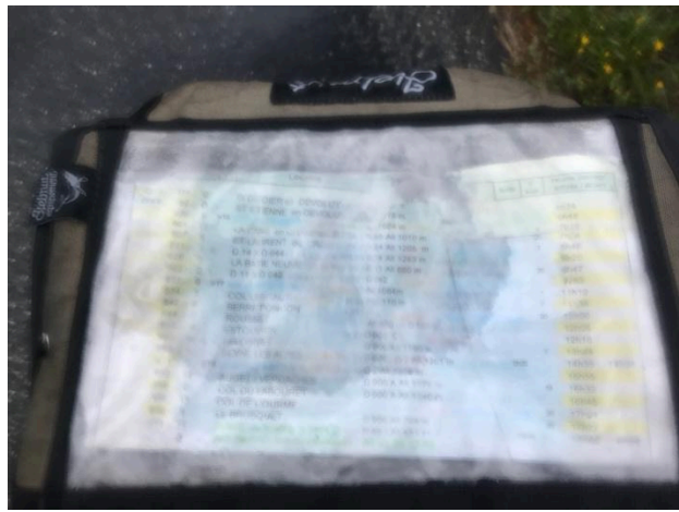
Going up towards SEYNE LES ALPES