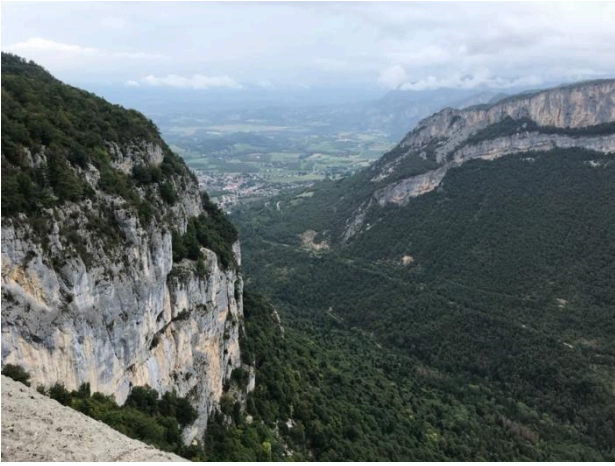
Another superb view