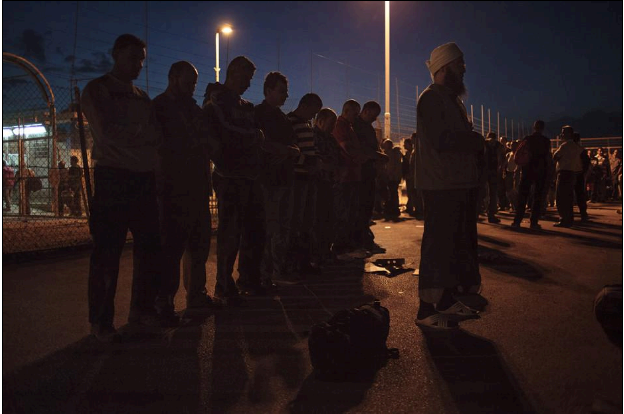
Muslim Palestinians pray at the Eyal checkpoint before crossing into Israel.