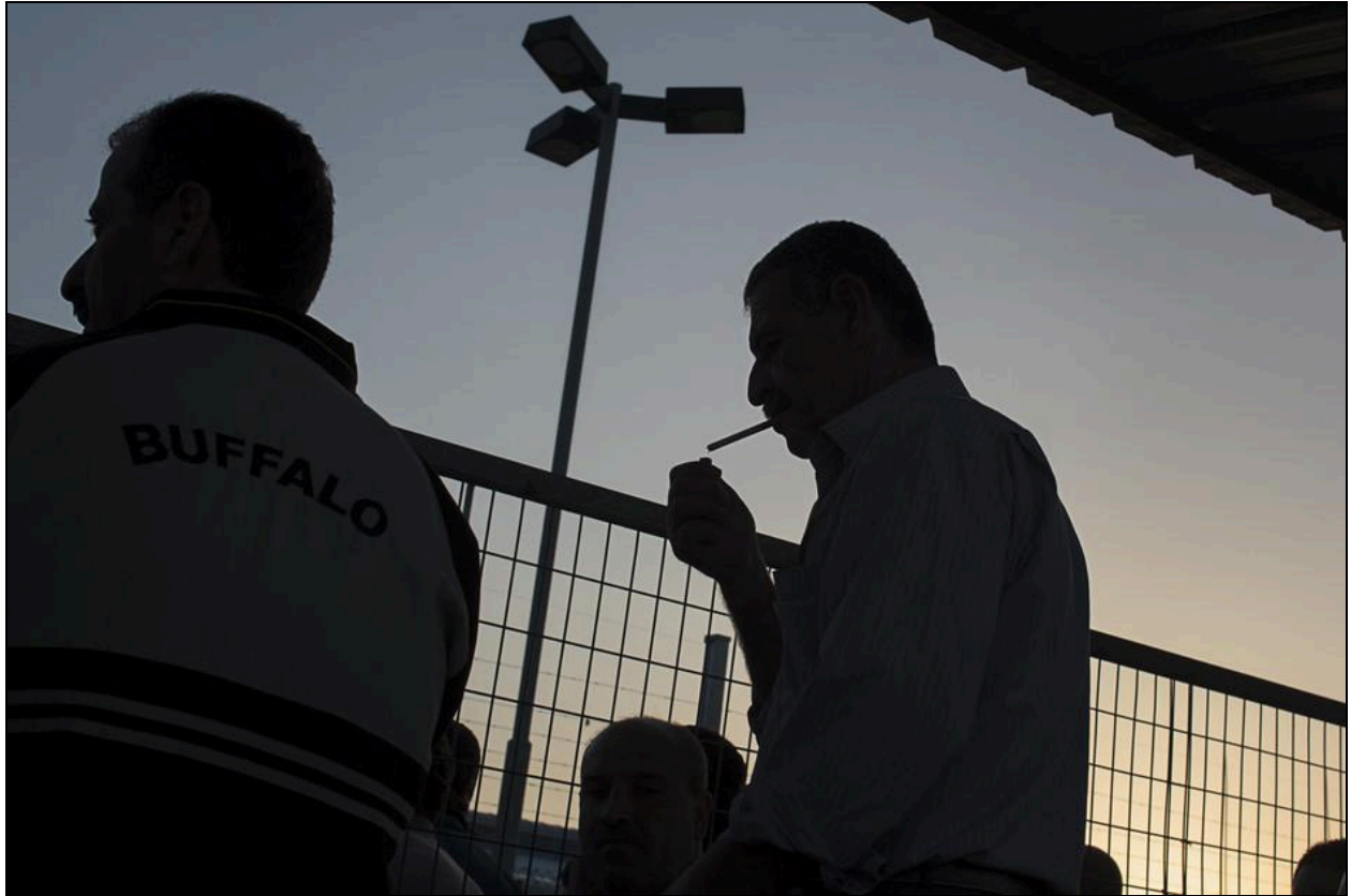
A Palestinian man lights a cigarette while waiting to cross through the checkpoint.