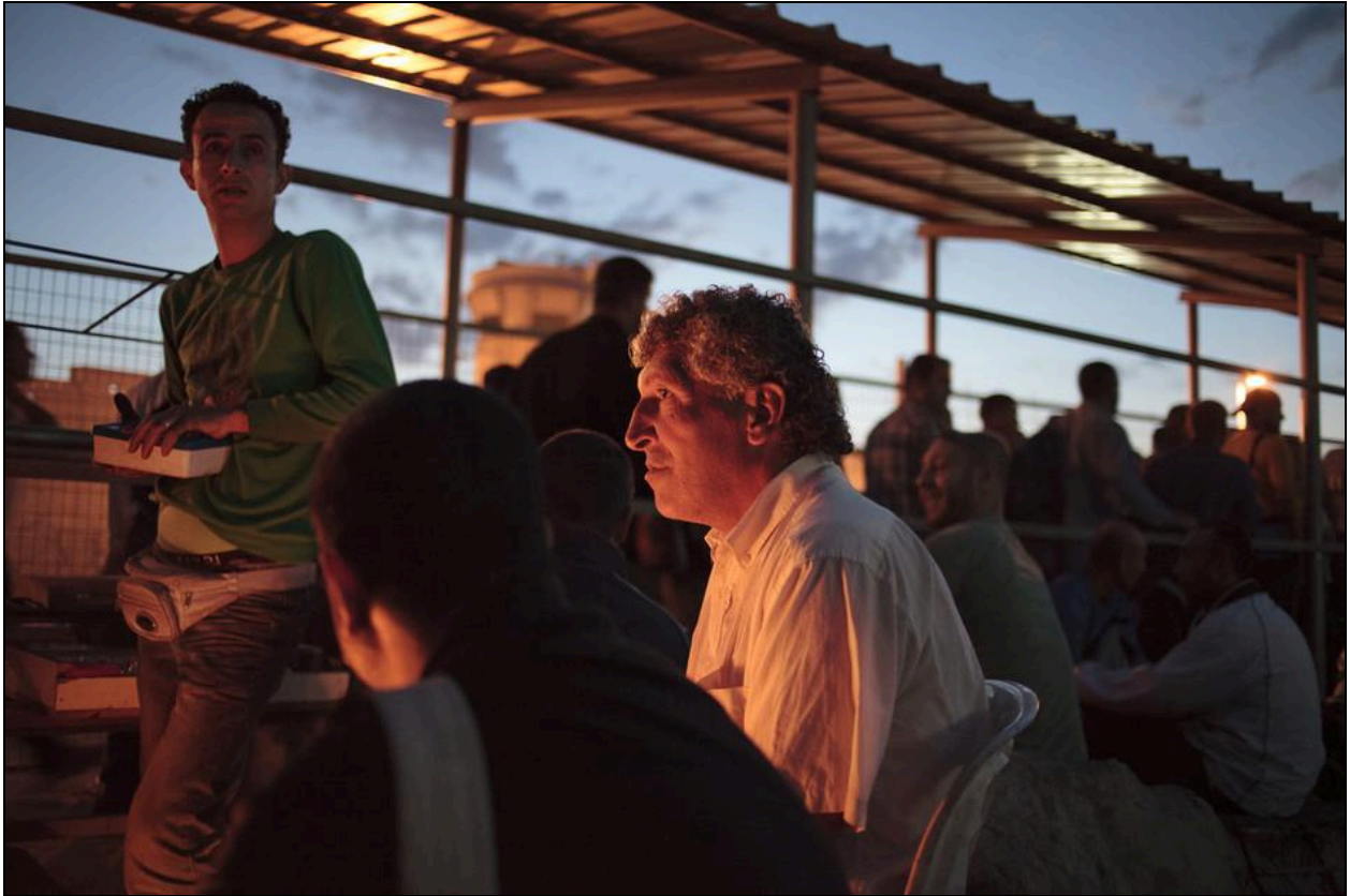
A Palestinian youth runs a makeshift coffee stand while his father sits beside a fire before getting in line to cross into Israel.