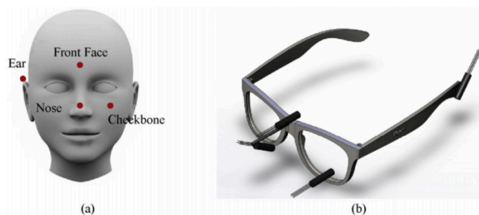
Fig. 2. (a) Information of image “a” and (b) information of image “b”

If the image is more than one, arrange the image based on Figure 2.