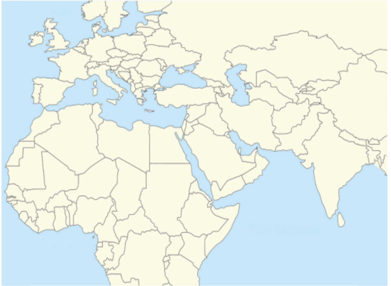
COUNTRY MAP #1