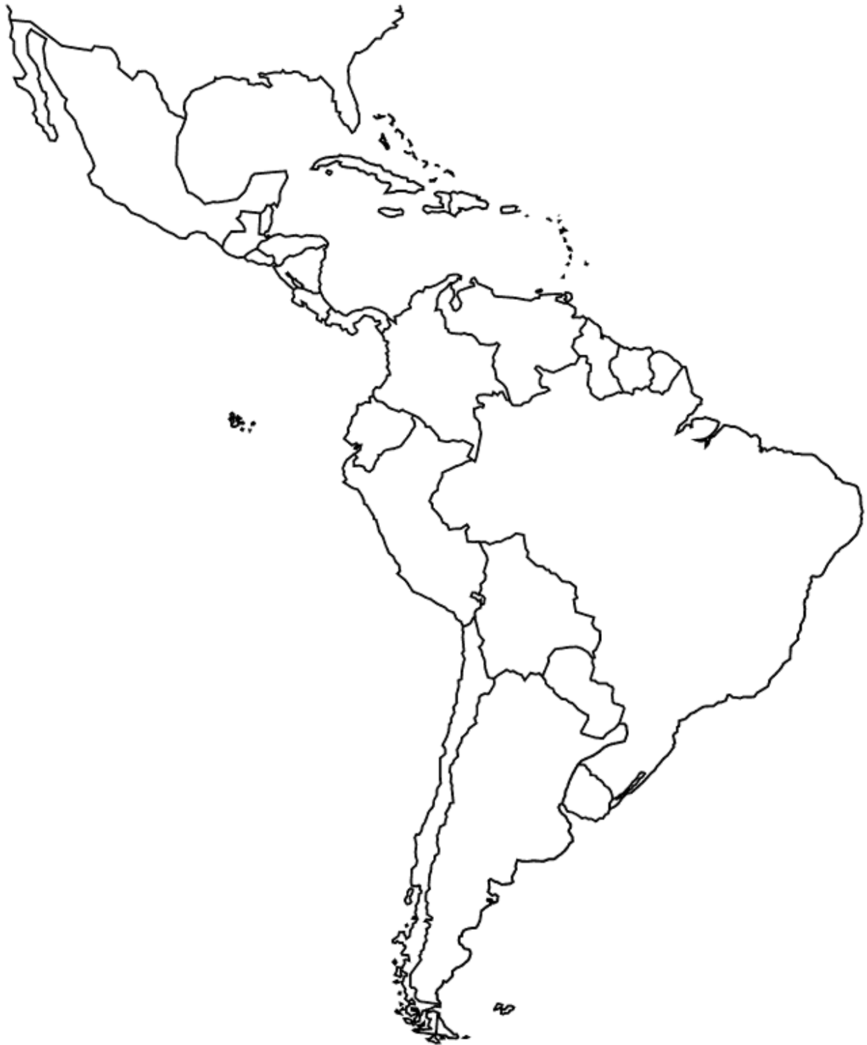
COUNTRY MAP #2