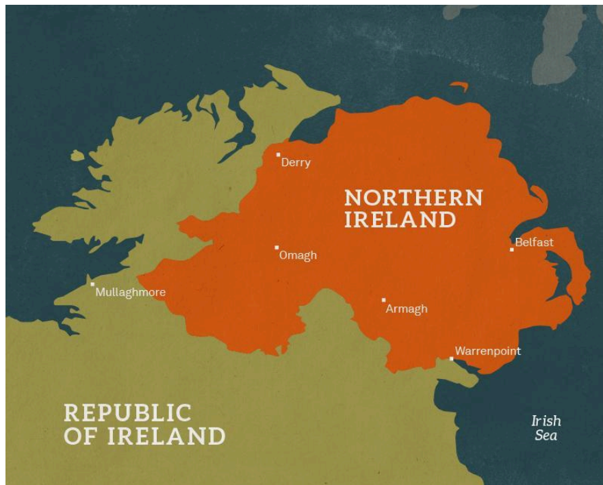
Map of Northern Ireland and important cities