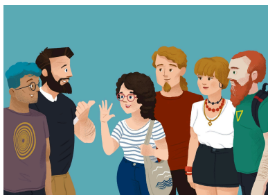
Kako se vi zovete?