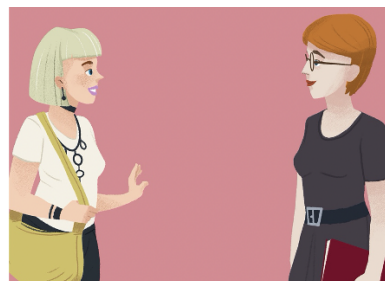
Kako se Vi zovete?