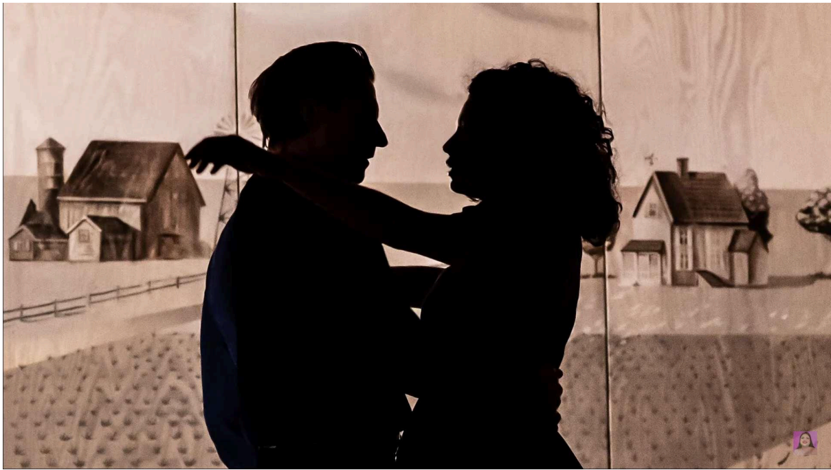
Alt: Part of Oklahoma in West End