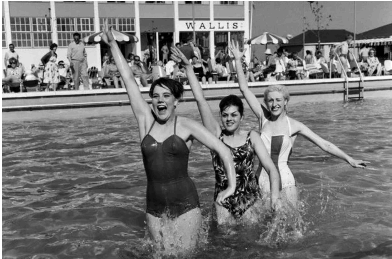
Fun in the pool at Butlin's Minehead, 1962