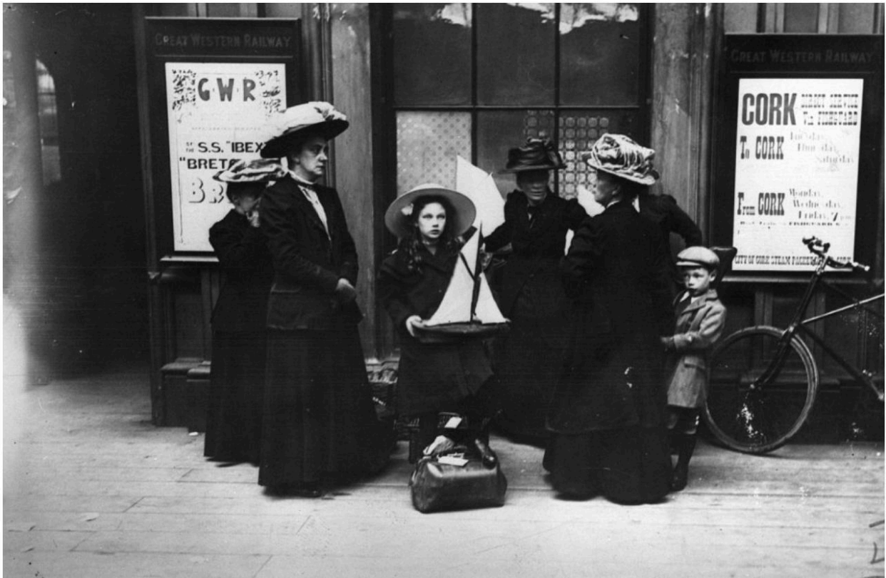
Holidaymakers heading to the seaside from Paddington Station, 1910

Women on holiday in Hastings, East Sussex, in 1938. Take note of the climbing attire and gear 🧐