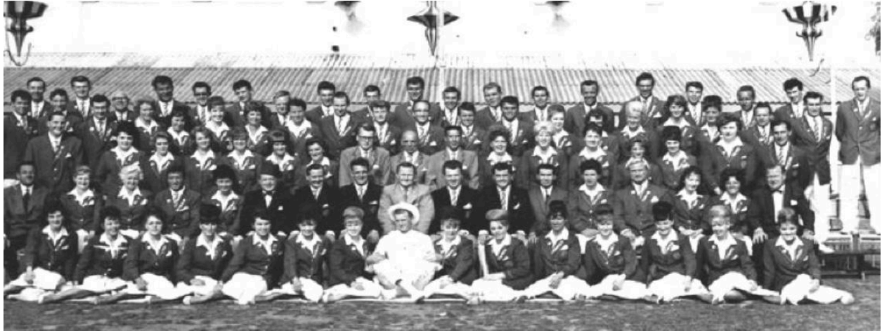
The Redcoats at Butlin's Skegness, 1963. The Redcoats encouraged all at camp to be active and engaged