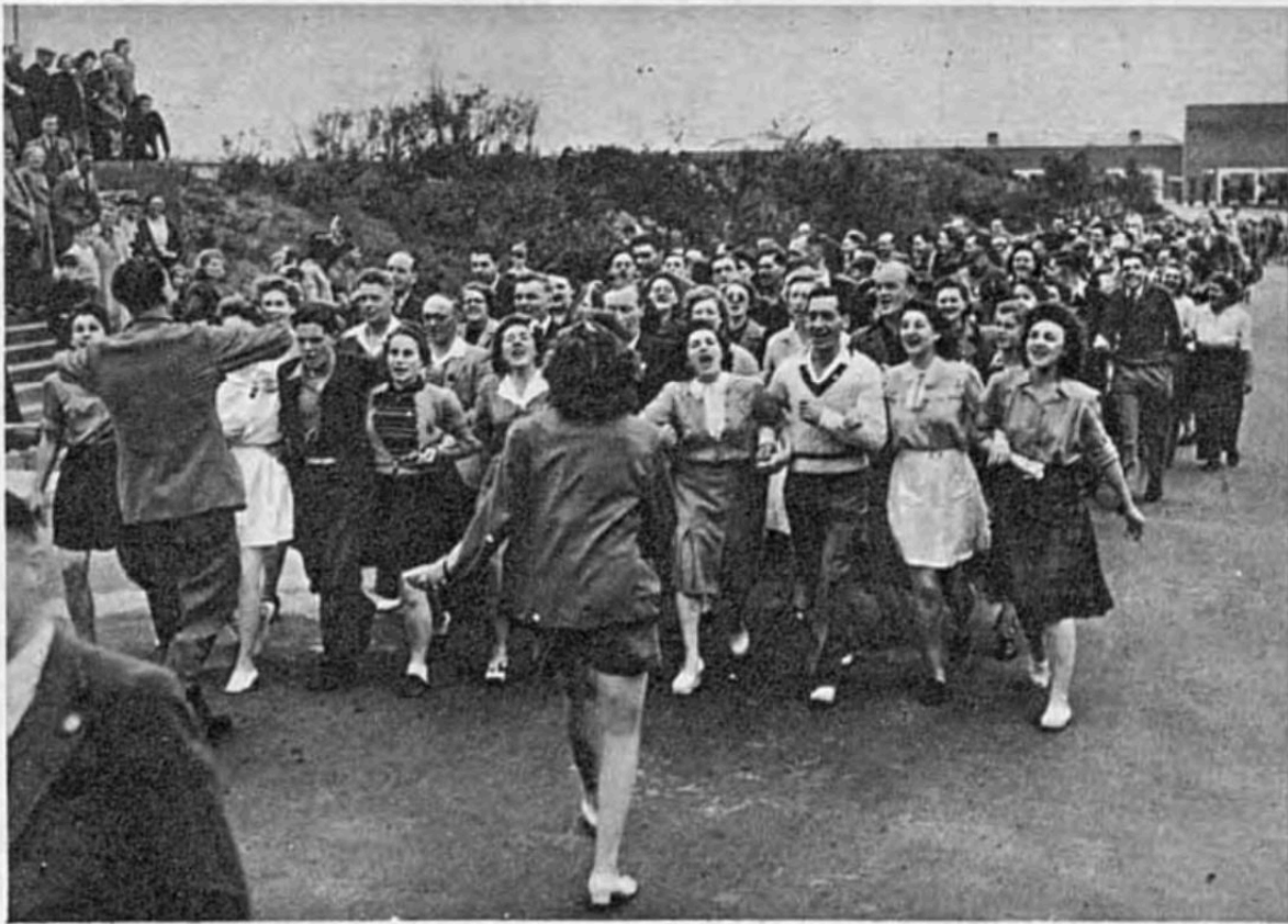
COMMUNITY SINGING—THE LADS AND LASSES LET THEMSELVES GO AT FILEY HOLIDAY CAMP : Mass enthusiasm is what Mr. Butlin seeks to create, and he succeeds mightily