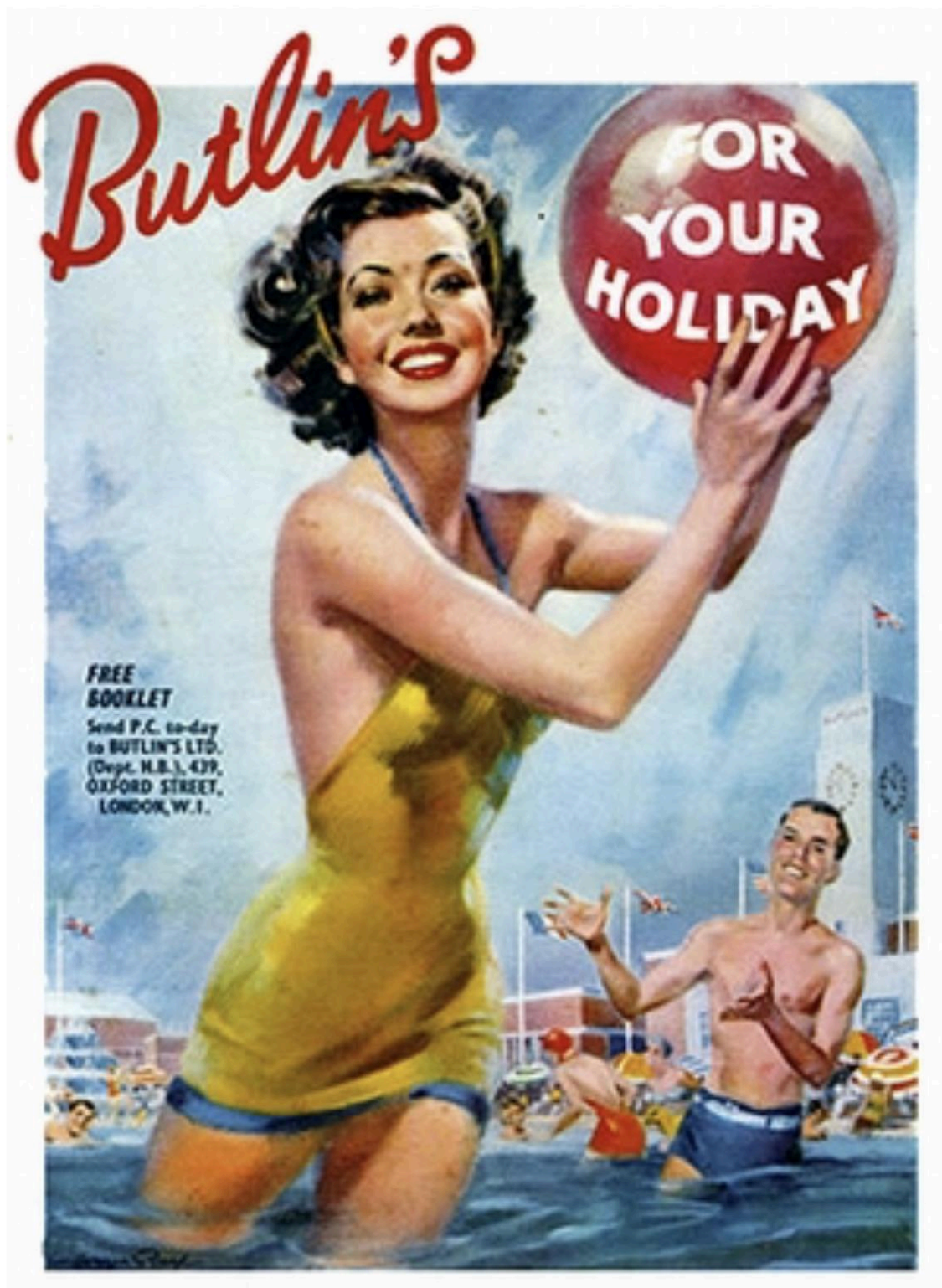
A Butlin's advert from the mid-twentieth century