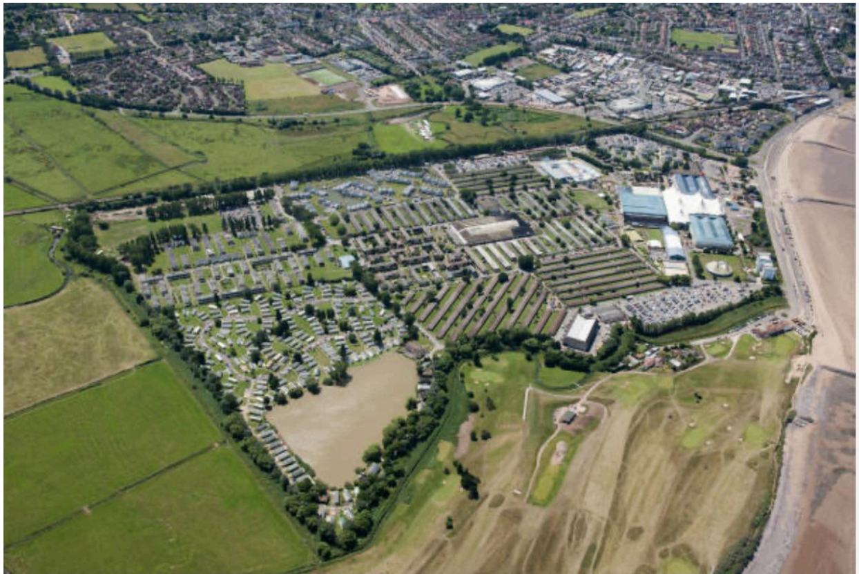
An aerial view of Butlin's Minehead. Note the physical enormity of the resort