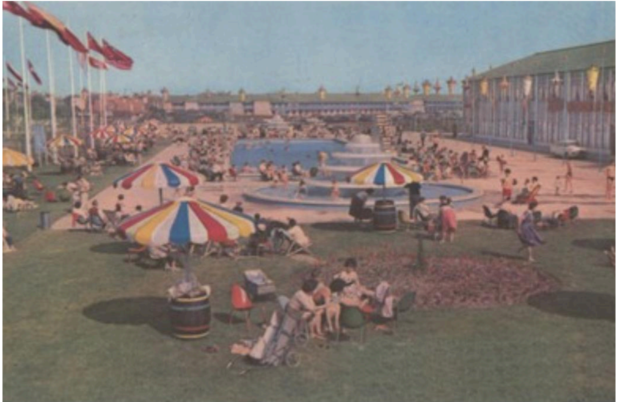
Butlin's Bognor Regis in the 1960s