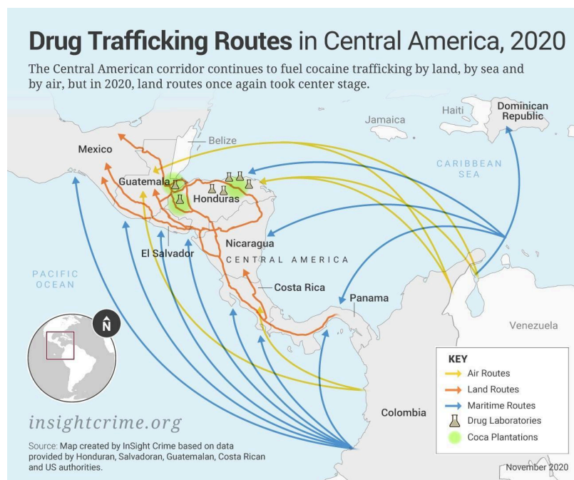
Figure 1: 2020 Drug trafficking routes in Central America

Drug addiction and the narcotics trade in South America pose a multifaceted and exceedingly complex challenge to the health, security, and economic stability of the region. For the last few decades, South America has been a major hub for illegal substance production and trafficking, especially in the case of cocaine and cannabis. Colombia, Peru, and Bolivia are major producers of these drugs, while Ecuador is a major transit point for international networks that transport drugs. The direct visible effects of drug addiction can be seen in much of the region's years of death and years lived with disability. In a recent paper, published in Lancet Psychiatry , serious harm exists in substance use; Cocaine is the major focus of prevention programs since it