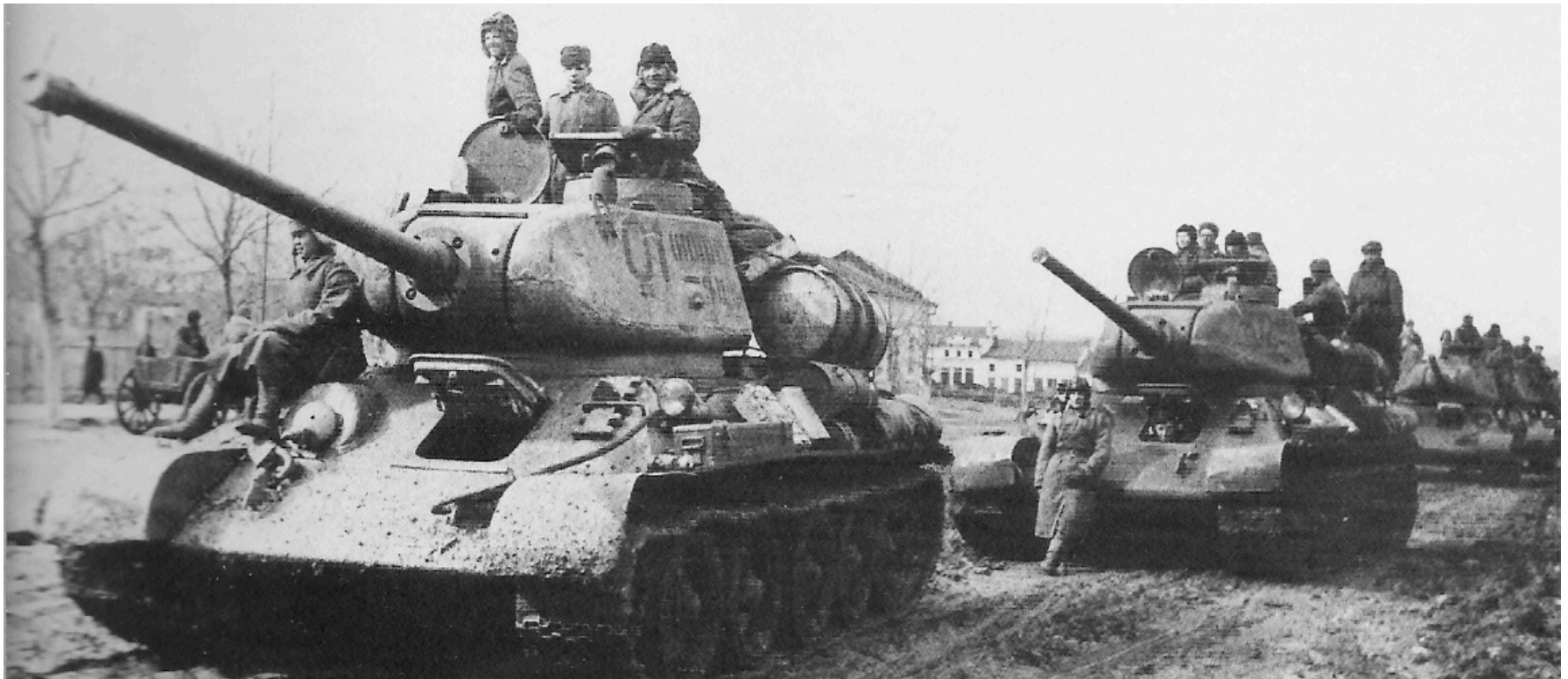
A column of Soviet tanks T34/85 (winter 1943-44)