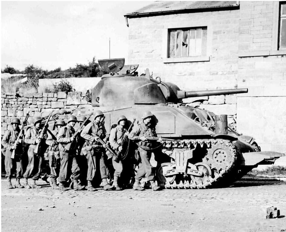
Combined arms in action: US M4 Sherman, equipped with a 75 mm main gun, with infantry walking alongside.