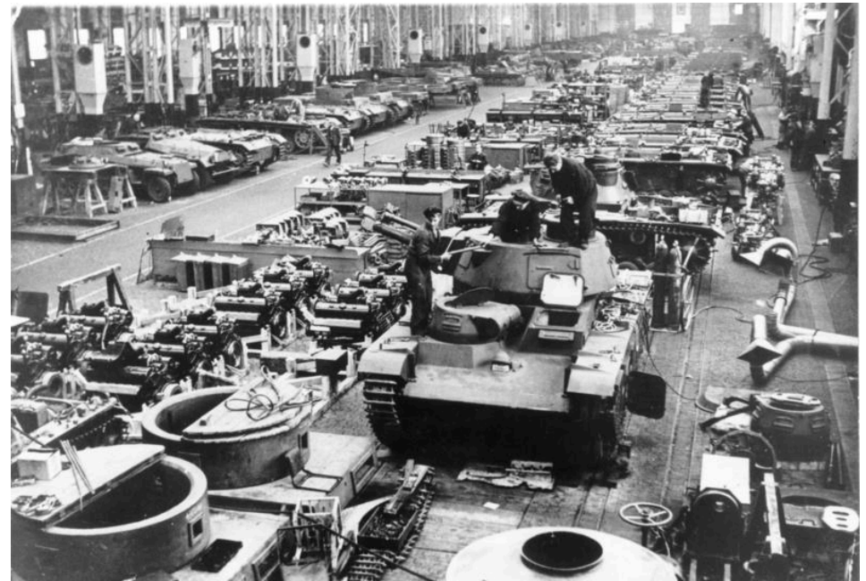
Manufacture / repair of tanks. In the foreground "Neubaufahrzeug" (PzKpfw NbFz V, Rheinmetall)