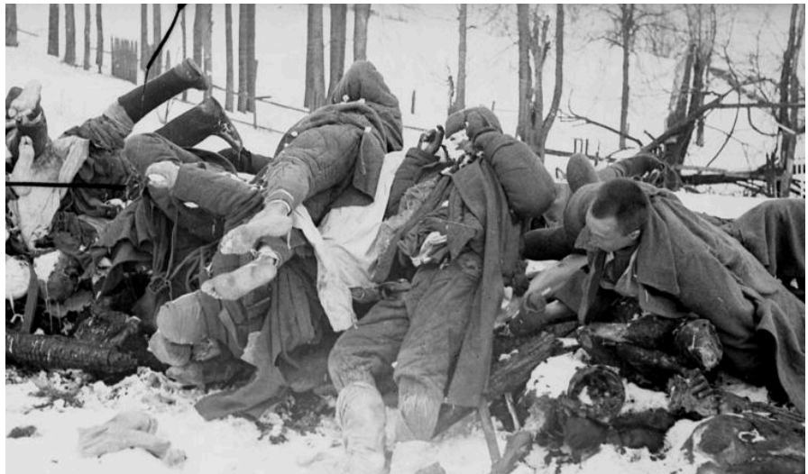
Dead Soviet soldiers, January 1942. Officially, roughly 8.7 million Soviet soldiers died in the course of the war.

60-85 million civilian and military deaths including lives lost to war-related disease and famine