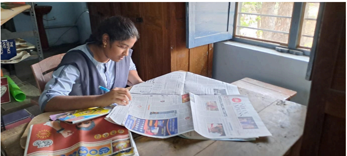
Students inculcating Newspaper reading habit in Library