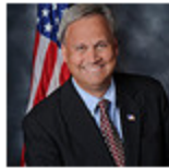
From TownePost Network