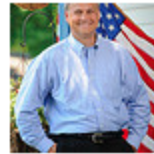
From TownePost Network