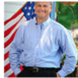
From TownePost Network