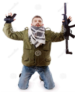
A terrorist gives himself up.