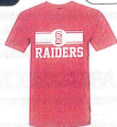
STARS & STRIPES

A PERCENTAGE OF EACH SPIRIT PACK SOLD WILL SUPPORT A RAIDER STUDENT ATTENDING THE 2024 FIELD TRIP TO LONDON, PARIS, LUCERNE, & MUNICH.