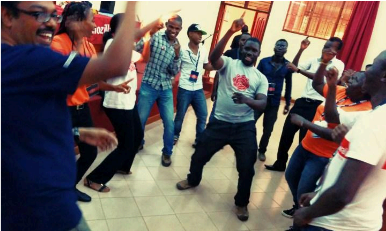
Celebrating at MozFest East Africa

You did one other thing this summer that I really want to call out — you demonstrated what the Mozilla community can be when it is at its best . So many of you took leadership and organized the people around you to do all the things I just listed above. I saw that online and as I traveled to meet with local communities this summer. And, as you did this, so many of you also reached out and mentored others new to this work. You did exactly what Mozilla needs to do more of: you demonstrated the kind of commitment, discipline and thoughtfulness that is needed to both grow and have impact at the same time. As I wrote in July, I believe we need simultaneously drive hard on both depth and scale if we want Webmaker to work. You showed that this was possible.