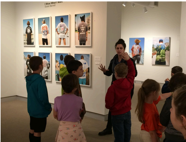
The museum docent shows us the exhibit

Our Online Scholastic Book Club ordering code is: GWBDJ