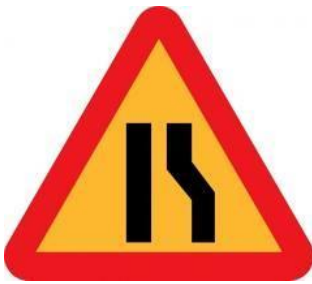
Approaching a Narrow Bridge

Road signs are traffic signs that are constructed to control, inform and regulate the conduct of road users on the road.