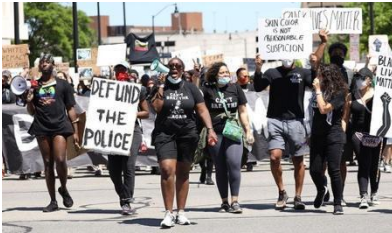
Rochesterians protesting in support of the Black Lives