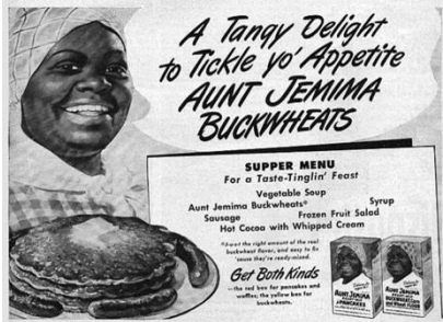
Aunt Jemima newspaper ad.