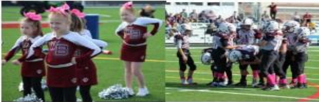
Tackle Football Ages 1st - 8th Grade

REGISTRATION IS NOW OPEN FOR TACKLE FOOTBALL & CHEERLEADING