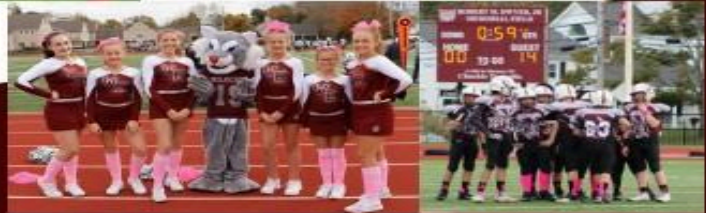
Cheerleading Ages Kindergarten - 8th Grade