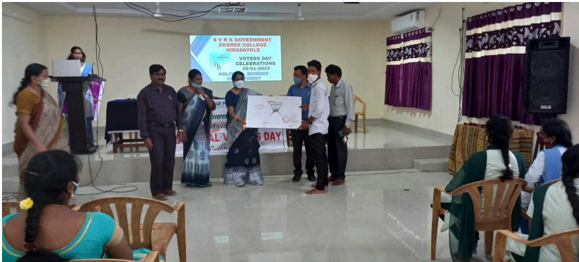
Poster Presentation by the students