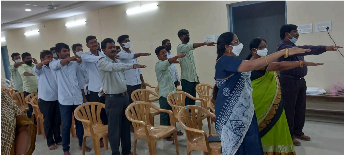
Voter Pledge by staff and students